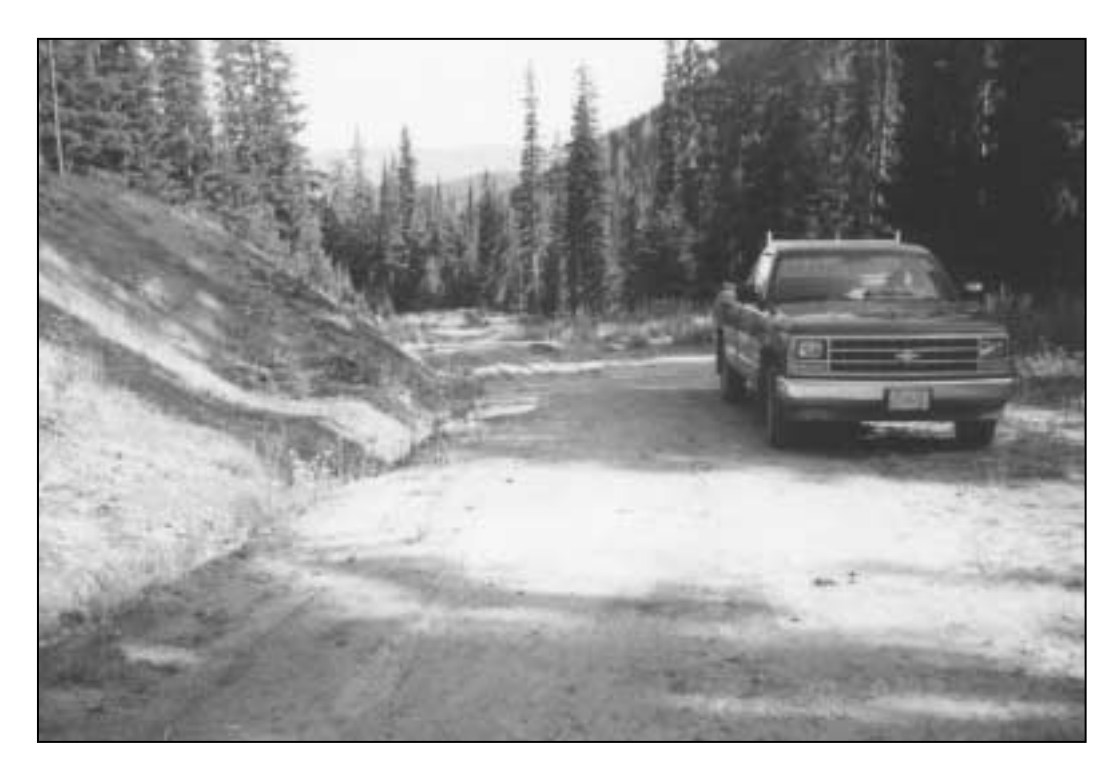
Figure A3.4. Example of sediment production class 4 (sediment production = 70 m<sup>3</sup>/km/yr).

Figure A3.3. Example of sediment production class 3 (sediment production = 15 m<sup>3</sup>/km/yr).