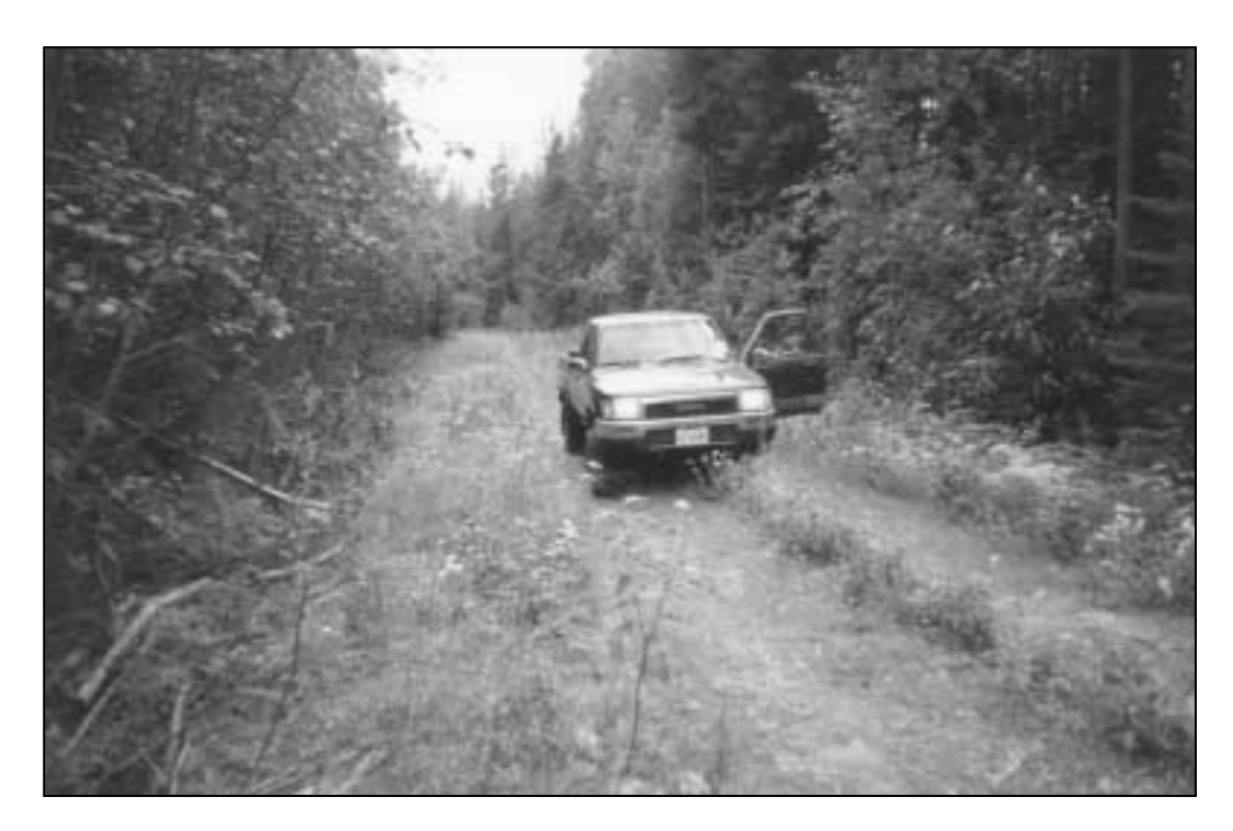
Figure A3.2. Example of sediment production class 2 (sediment production = 1.0 m<sup>3</sup>/km/yr).

Figure A3.1. Example of sedimental production class 1, see Table A3.1 (sediment production = 0.1 \text{ m}^3/\text{km/yr} ).